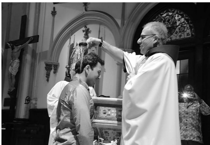
Sacrament of Baptism at the Easter Vigil on March 26, 2016

BAPTEMES : Les préparations doivent commencer un mois à l'avance. Présentez-vous au bureau paroissial ou téléphonez au 212-749-0276 ext : 110. Baptêmes en Français 1 er dimanche du mois, en Anglais 2 ème dimanche, en Espagnol 3 ème dimanche. En premier lieu parents, parrains et marraines doivent participer à une préparation au sacrement du Baptême.